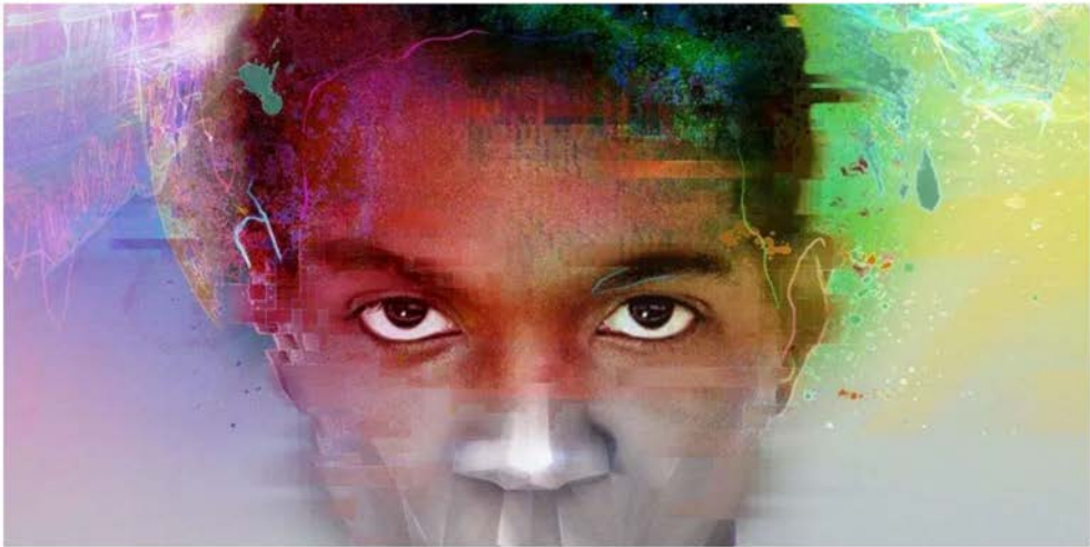
Orfeus A House Music Opera at The Young Vic